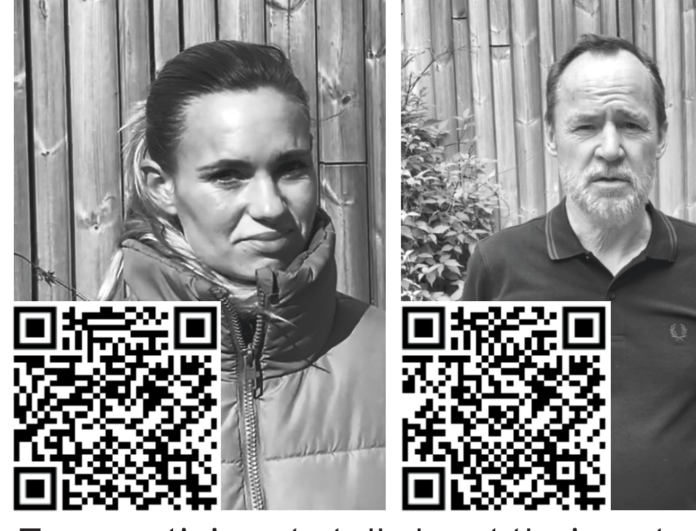
Two participants tell about their outcome